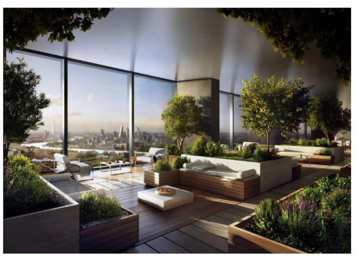
CGI of the new garden space at Landmark Pinnacle.

Landmark Pinnacle, Europe's tallest residential tower completing in 2020, will become home to the first ever private garden of its kind in East London.